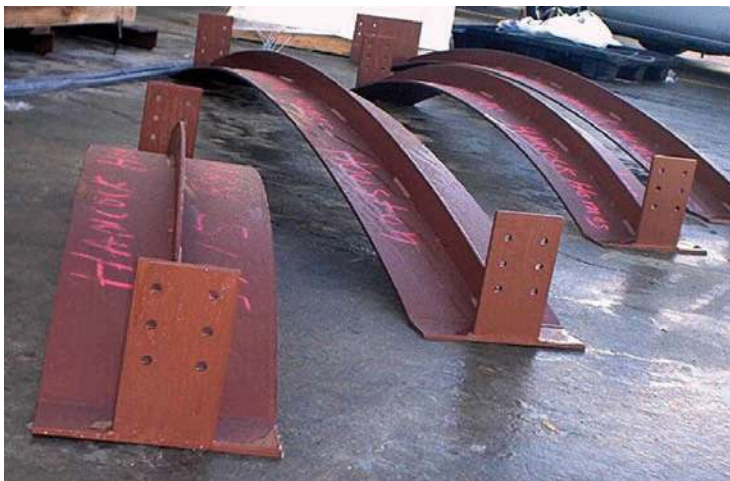
Heavy-duty arched plates suitable for high-strength fastening-to-framing corrosion-resistant metal primer coating.