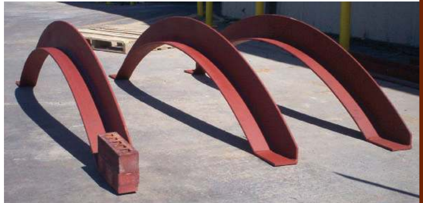
Arched lintels. (6" x 4" x 3/8" shown.)