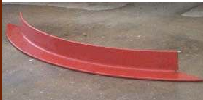
Standard bay window lintel