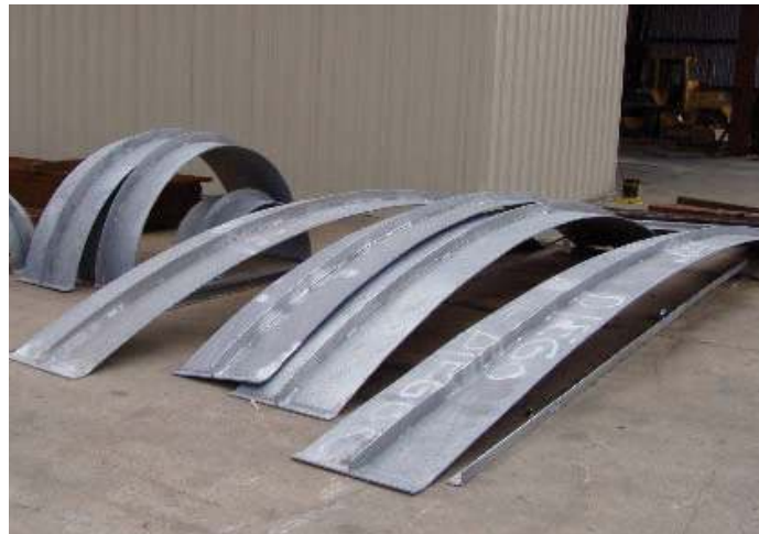
Standard duty arched plates Hot-dipped galvanized.