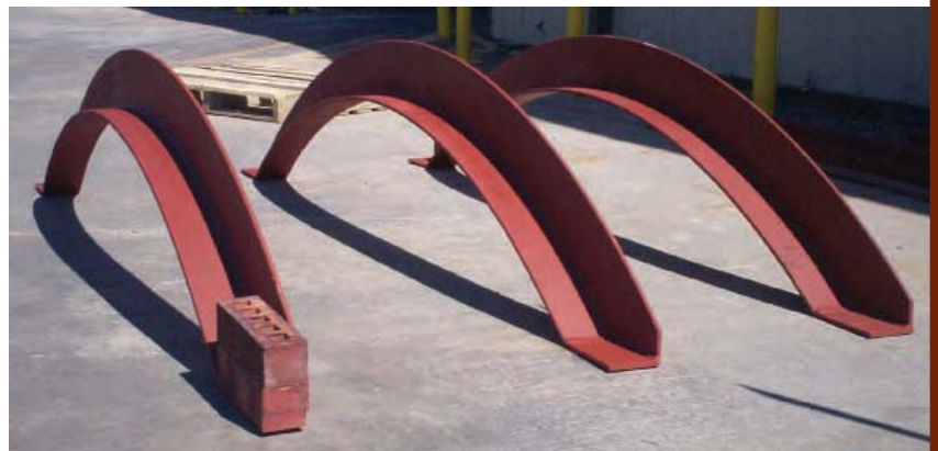
Arched lintels. (6" x 4" x 3/8" shown.)