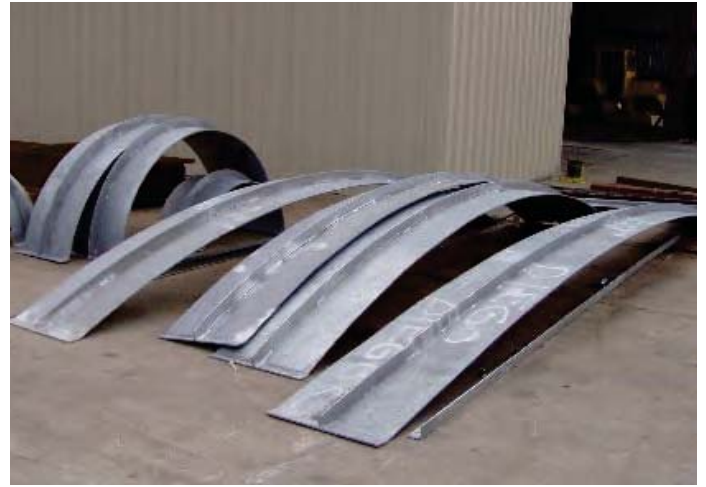
Standard duty arched plates Hot-dipped galvanized.