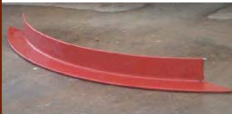
Standard bay window lintel