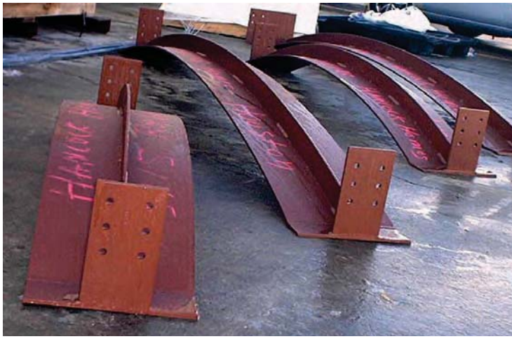
Heavy-duty arched plates suitable for high-strength fastening-to-framing corrosion-resistant metal primer coating.